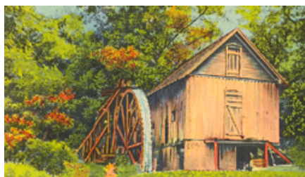
Burket's grist mill may have resembled this

In 1796, Burket was assessed taxes for land in Turkeyfoot Twp., Somerset County. Sometime around 1805, he and Franky moved south across the state line into Kingwood, Preston County, WV. They continued to own land in Somerset County during that time.