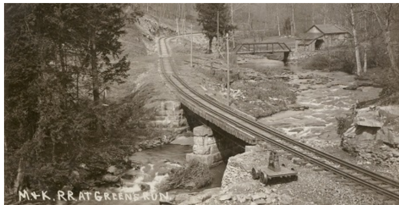
Green's Run, spanned by Morgantown and Kingwood Railroad bridge